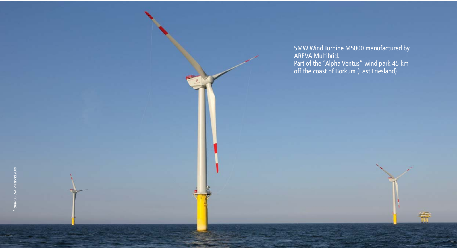
5MW Wind Turbine M5000 manufactured by AREVA Multibrid. Part of the "Alpha Ventus" wind park 45 km off the coast of Borkum (East Friesland).